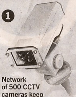
Network of 500 CCTV cameras keep watch over streets

"The CCTV element is part curiosity, like a 21st-century version of Big Brother, and partly about security," said